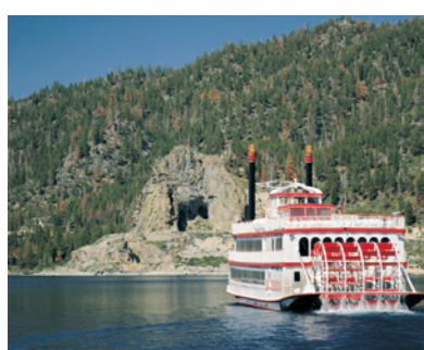
From top: Olympic Rings at Squaw Valley, Sand Harbor, MS Dixie and Cave Rock.